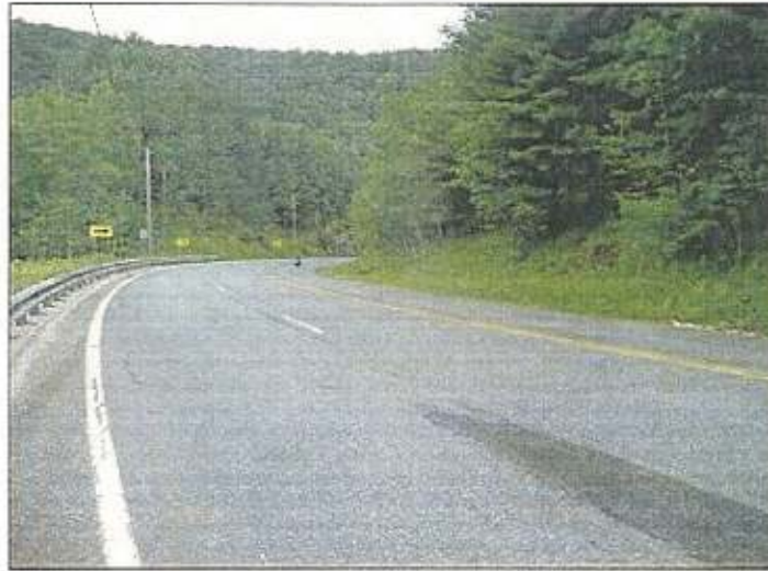
Figure 1 – Overview View of the Site

width of 17', encompassing both the travel lane and shoulder, for a total area of approximately 4522 ft 2 .