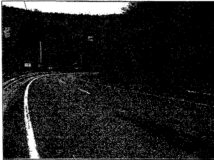
Figure 1 – Overview View of the Site

width of 17', encompassing both the travel lane and shoulder, for a total area of approximately 4522 ft 2 .