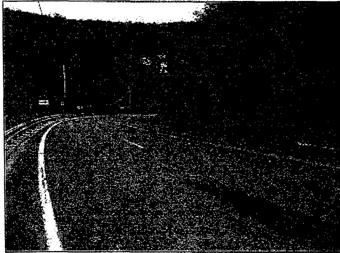
Figure 1 – Overview View of the Site

width of 17', encompassing both the travel lane and shoulder, for a total area of approximately 4522 ft 2 .