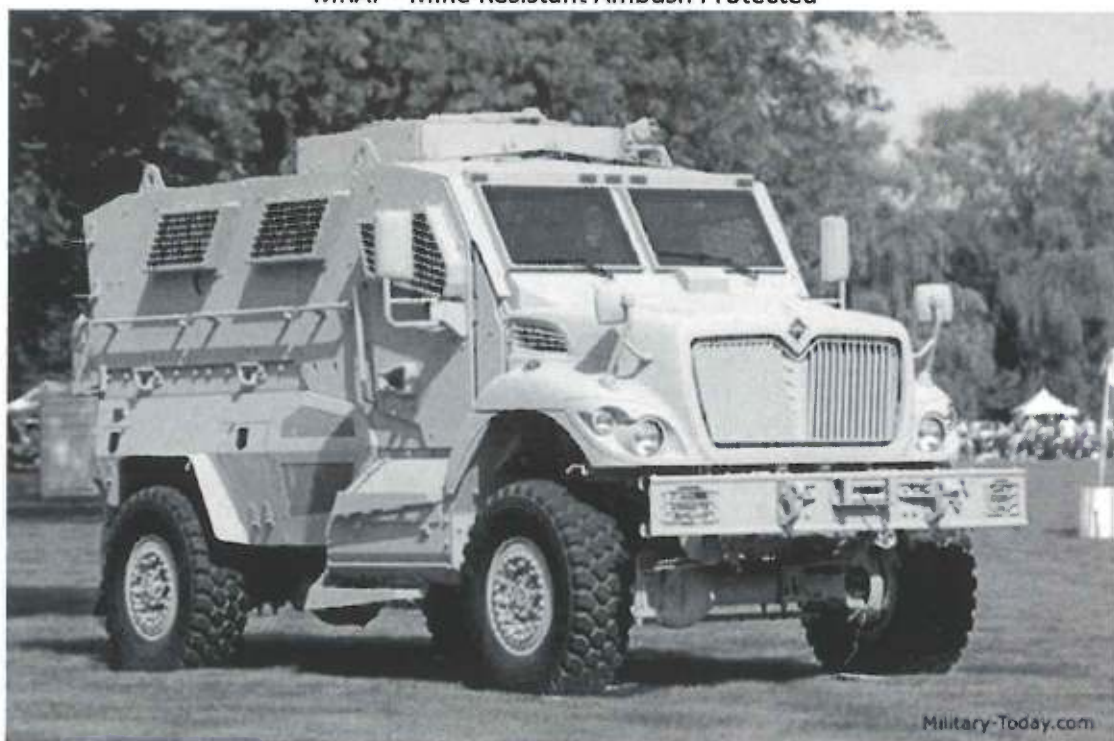
MRAP - Mine Resistant Ambush Protected